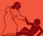
GROWING IN VIRTUE