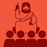
VIRTUAL TALKS W/ SPEAKERS